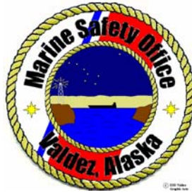
UNITED STATES COAST GUARD CAPTAIN OF THE PORT PRINCE WILLIAM SOUND