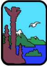
ALASKA DEPT OF ENVIRONMENTAL CONSERVATION